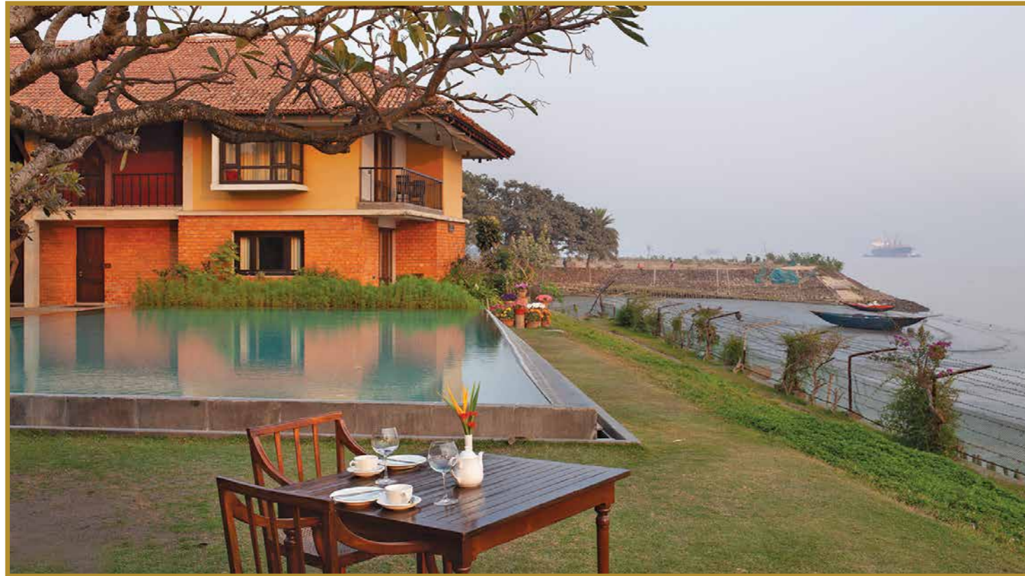
The glorious Ganga Kutir on the banks of the Hooghly

Raichak on Ganges, celebrating 25 years of its existence, is a splendid leisure destination developed over 100 acres on the banks of the Hooghly near Kolkata. It comprises The Ffort Raichak with 60 well-appointed rooms and two presidential suites, 31 suites (The Ffort Suites Apartment) and 19 duplex villas (Anaya) surrounded by manicured lawns and gardens, water bodies and swimming pools. Ganga Kutir is a boutique hotel also on the premises, consisting of 16 guest rooms by the river and 10 duplex pool villas. A comprehensive hospitality offering, Raichak on Ganges also houses country homes (Ganga Awas), multi-cuisine and specialty restaurants, a health centre, a bar, spa, and a well-appointed sports lounge. An ideal venue for corporate celebrations and even memorable weddings, Raichak on Ganges is also a superb holiday destination for the entire family.