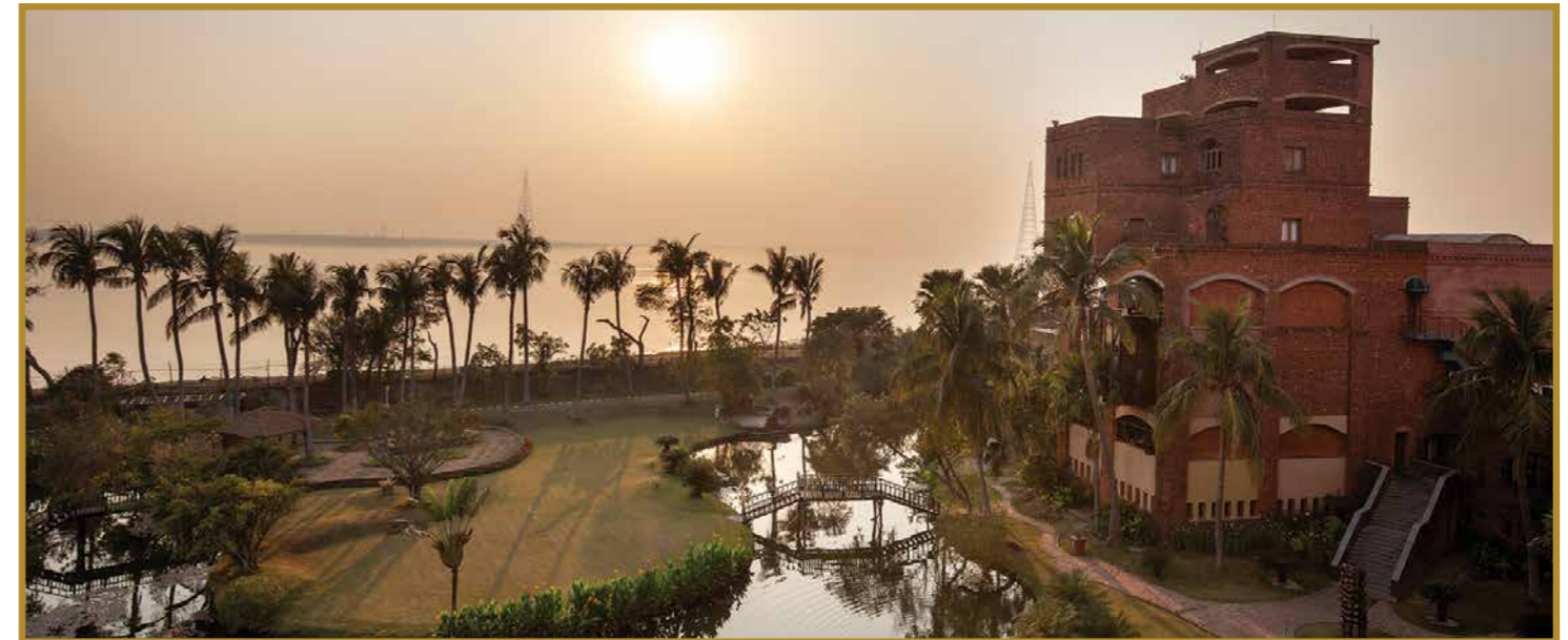
The majestic Ffort Raichak that harbours its own exciting story