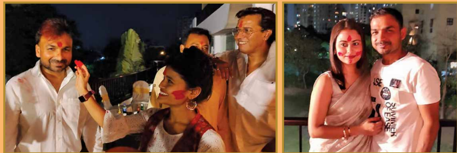
Rang Rasia, Club Verde's pre-Holi celebrations, took place over live music and an array of Holi's special delicacies. Members had a gala time, ushering in the festival with colour, laughter and exemplary bonding.