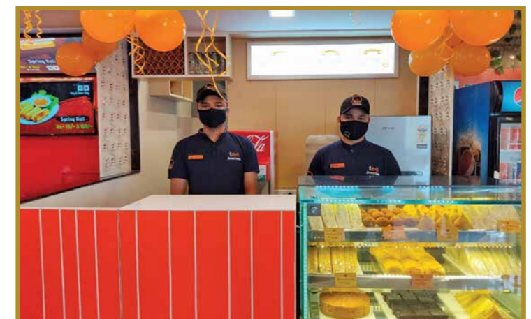
Tea Junction is going places as it opened a new outlet at Paradise Food Court, Cosmos Mall, in Silliguri recently.