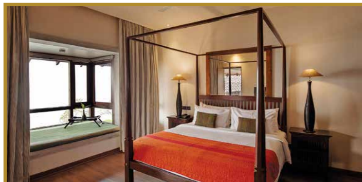
A glimpse of one of the rooms at Ganga Kutir

Raichak on Ganges, celebrating 25 years of its existence, is a splendid leisure destination developed over 100 acres on the banks of the Hooghly near Kolkata. It comprises The Ffort Raichak with 60 well-appointed rooms and two presidential suites, 31 suites (The Ffort Suites Apartment) and 19 duplex villas (Anaya) surrounded by manicured lawns and gardens, water bodies and swimming pools. Ganga Kutir is a boutique hotel also on the premises, consisting of 16 guest rooms by the river and 10 duplex pool villas. A comprehensive hospitality offering, Raichak on Ganges also houses country homes (Ganga Awas), multi-cuisine and specialty restaurants, a health centre, a bar, spa, and a well-appointed sports lounge. An ideal venue for corporate celebrations and even memorable weddings, Raichak on Ganges is also a superb holiday destination for the entire family.