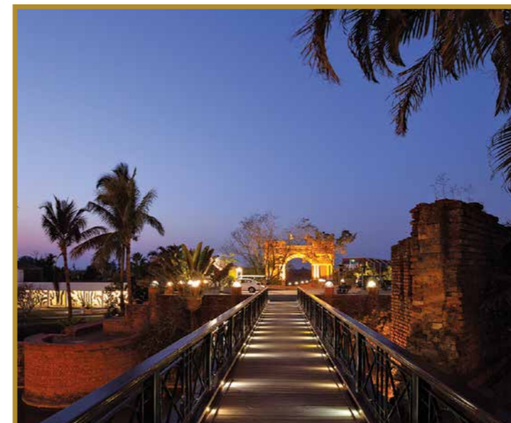
Ffort Raichak by twilight, wrapped in secret mysteries