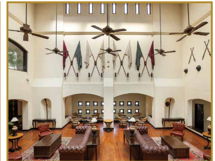
A section of Ffort Raichak's reception lounge