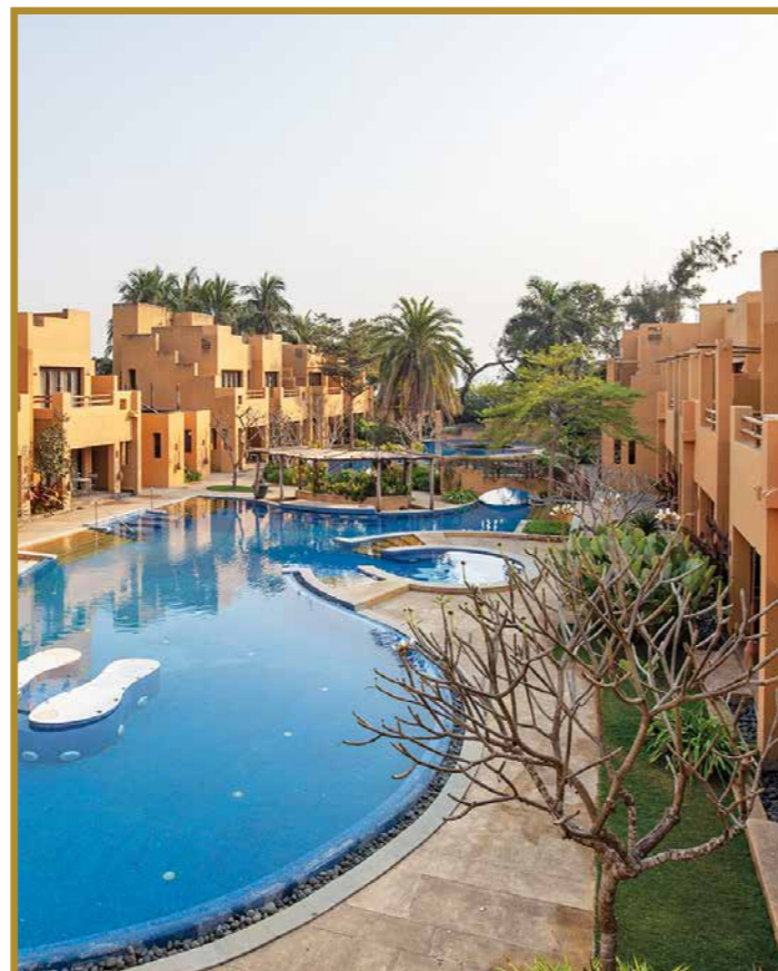
Anaya's cluster of duplex villas perfumed by frangipani