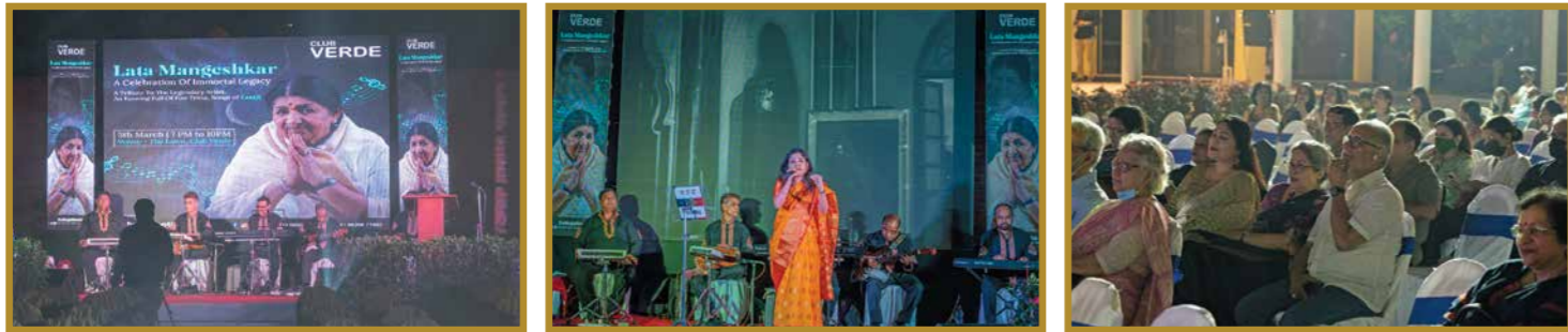
India has sadly lost her most famous nightingale. 'Lata Mangeshkar - A Celebration of Immortal Legacy,' was organised recently at Club Verde for its members and their guests to invoke memories of such an iconic chanteuse.