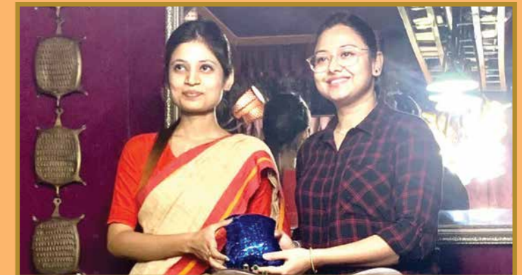
International Women's Day was celebrated at our casual smart dining outlets to honour our female staff. This special day is commemorated in a variety of ways worldwide. 'Gender equality today for a sustainable tomorrow' is this year's motto.