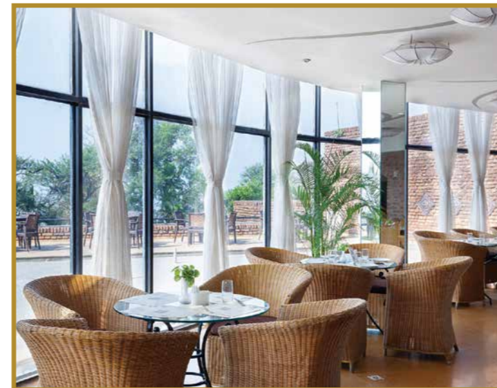
The coffee shop at Ffort Raichak