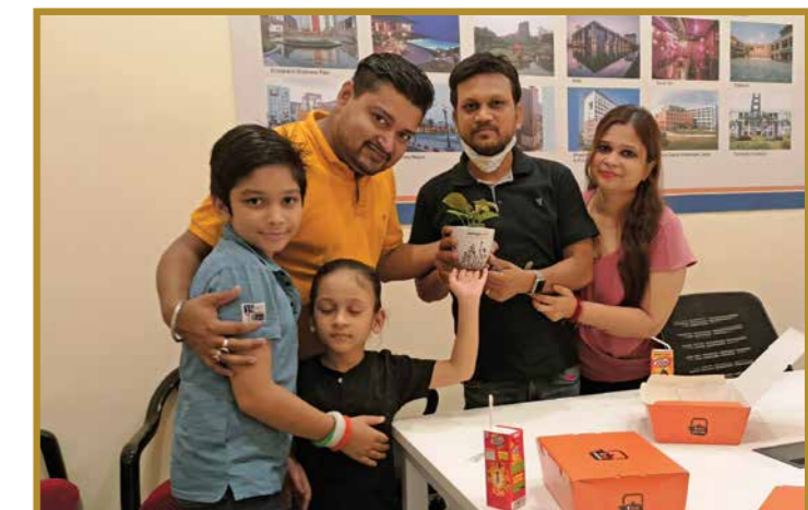
Utsodhaara Teesta Township in Siliguri had residents arrive in large numbers to usher in Independence Day in the true spirit of freedom