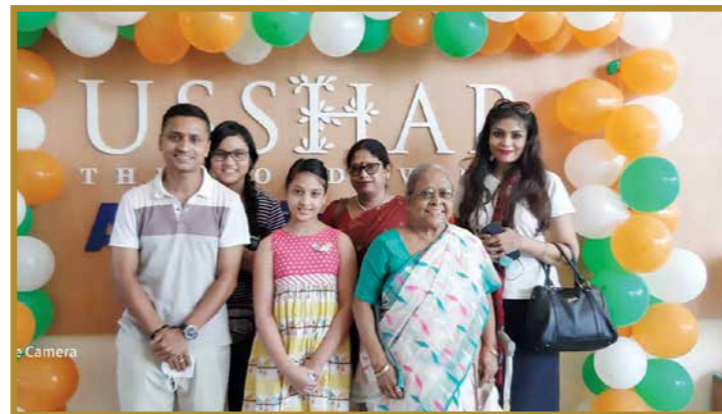
Independence Day celebrations at Usshar - The Condvilve with residents and their family members