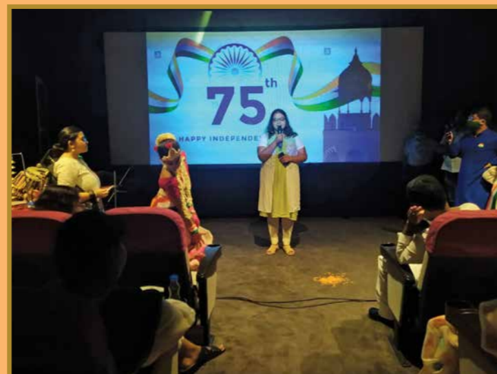
At Utalika Luxury, celebrations included flag-hoisting by residents, a cultural programme and a sit-and-draw competition by tiny tots