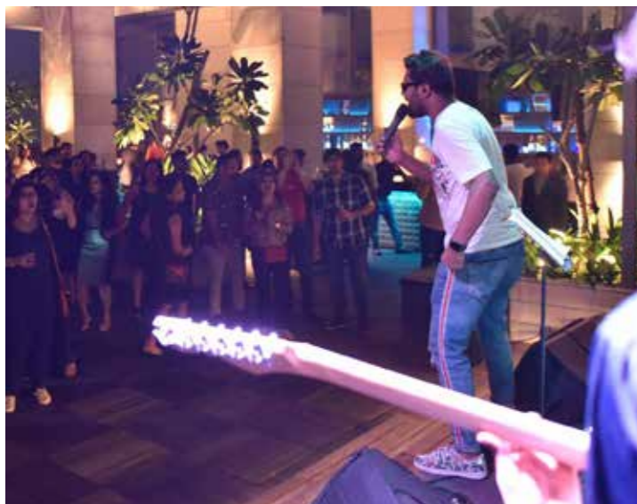
Rahul Jain, Bollywood's popular musician, recently performed at Capella at AltAir, mesmerizing the audience with a collection of romantic songs