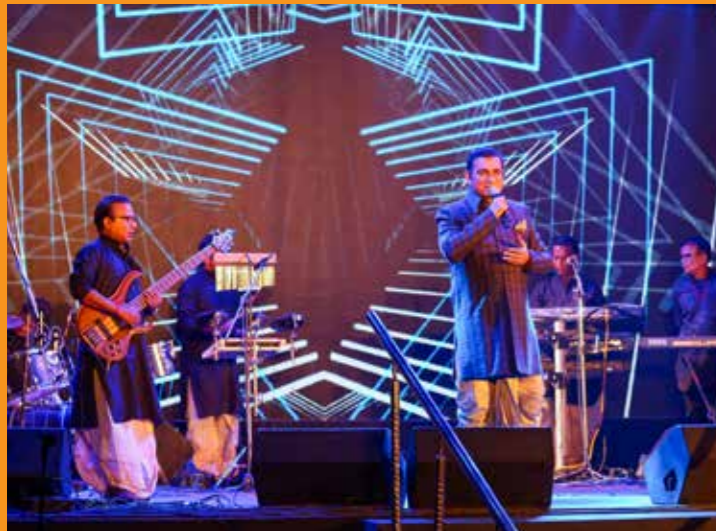
Chandrakosh is an annual event that is closely associated with clubs of the Ambuja Neotia Group. This year playback singer Abhijeet Bhattacharya was part of the concert held at Club Verde in Kolkata, who kept the audience enthralled with his performance.