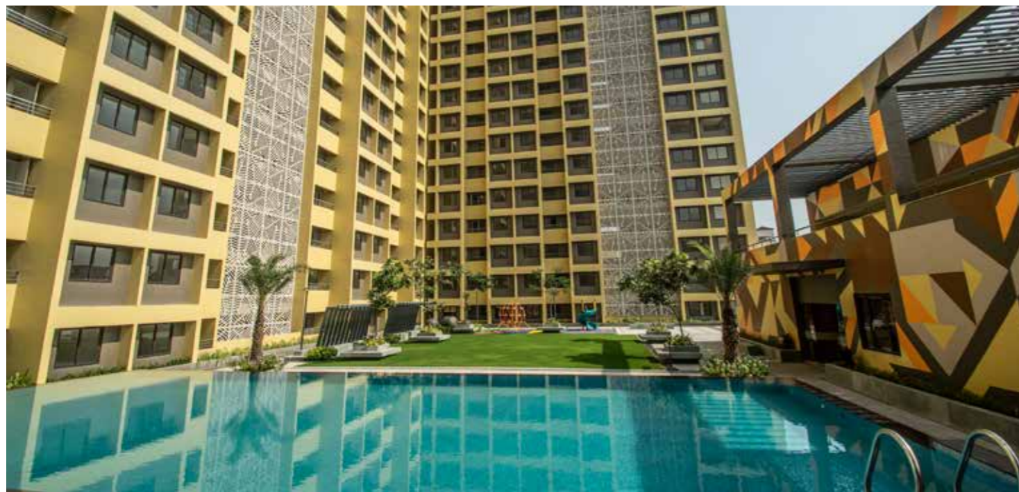
A panoramic view from the swimming deck