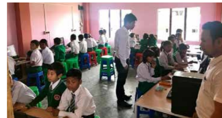
A glimpse of the training session undertaken by myELSA in a school, familiarising students on the use of the app