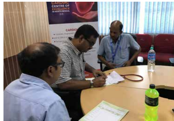
Neotia Getwel Healthcare Centre organised a corporate health talk & checkup camp in association with Airport Authority of India, Bagdogra