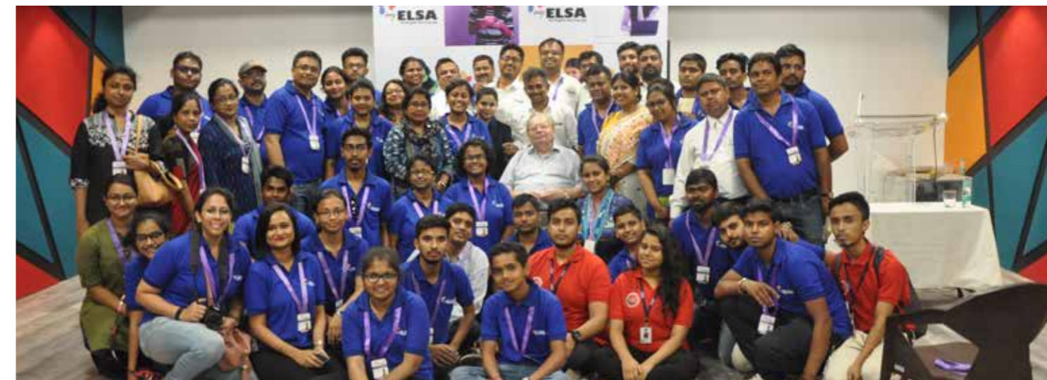
Ruskin Bond along with the myELSA team during a recently held event in Kolkata where the English Learning app was launched to provide solutions for school curriculum and spoken English communication from classes 5 to 12