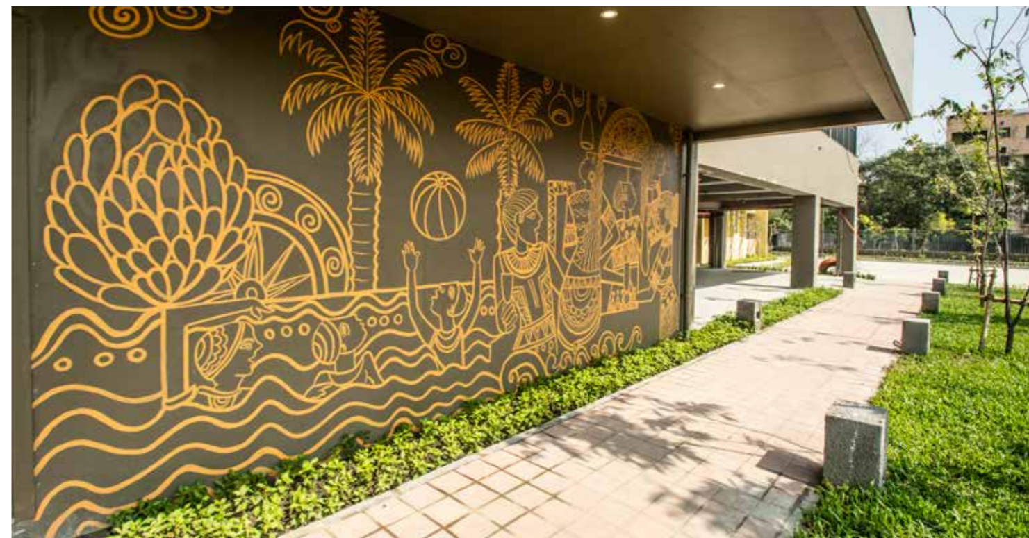
Wall art at the Residents' Activity Centre