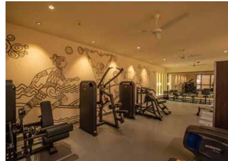
The state-of-the-art gym for the health-conscious