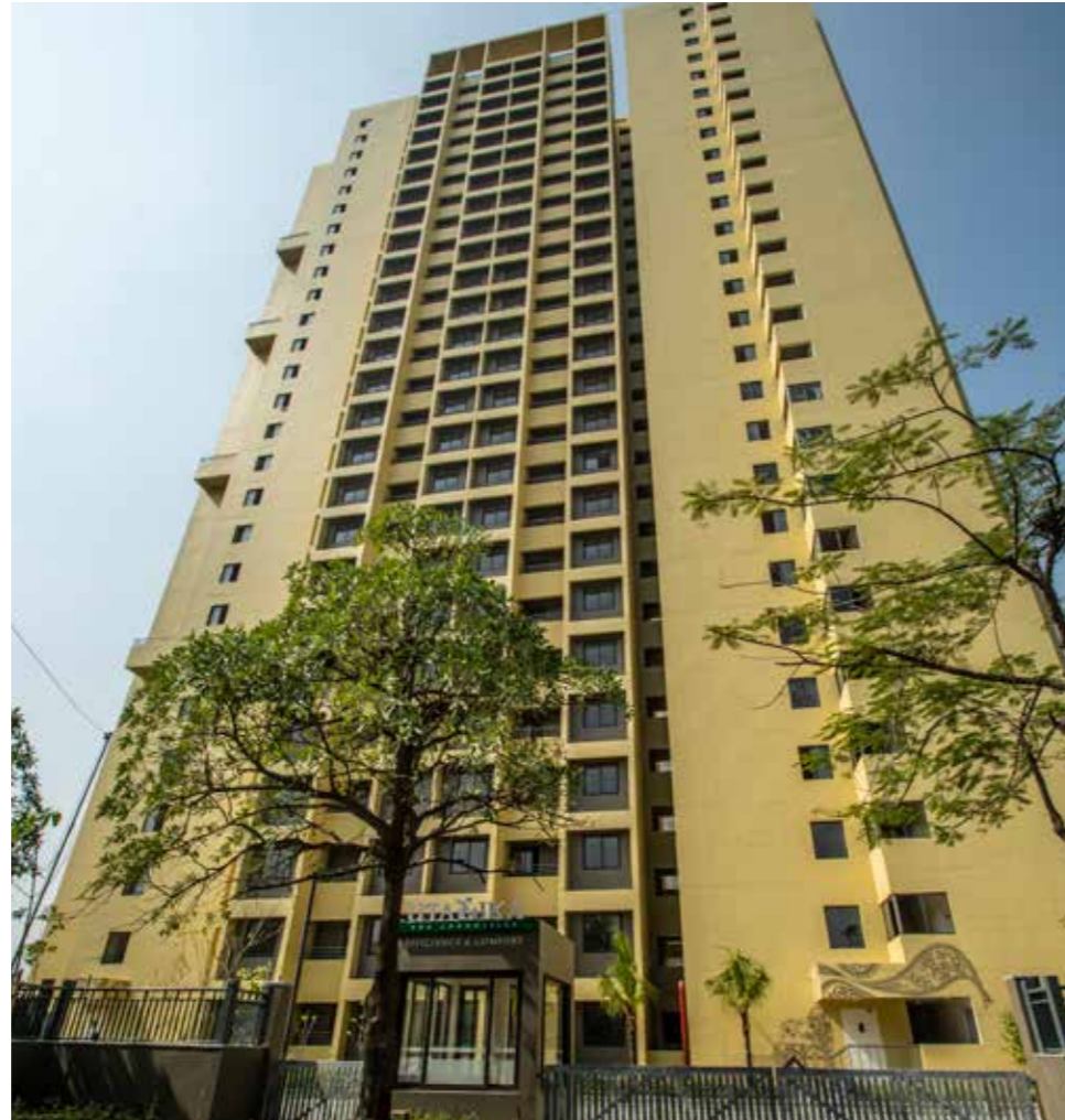
The entrance of Utalika - The Condoville, Efficiency & Comfort complex

Utalika – The Condoville's Efficiency and Comfort Complex comprises 545 apartments in a single G+25 tower. With a podium garden at the first-floor level accentuated by lush greenery, a swimming pool with a sundeck, open-air terraces, a gymnasium, a reading room and an indoor games room, a banquet hall, a celebration terrace and more, Utalika is designed to cater to the wellbeing of its residents. Here, families will not only live in contentment and ease but also find friendly neighbours. The children will come across a chance to play in secure surroundings and the elderly will discover like-minded mates. After all, we cannot live only for ourselves. A thousand fibres connect us with our fellow men. We hope Utalika will bring a strong sense of community living, as we have attempted to create a mix of superior design elements and a holistic living experience. As Coretta Scott King says, 'the greatness of a community is most accurately measured by the compassionate actions of its members.'