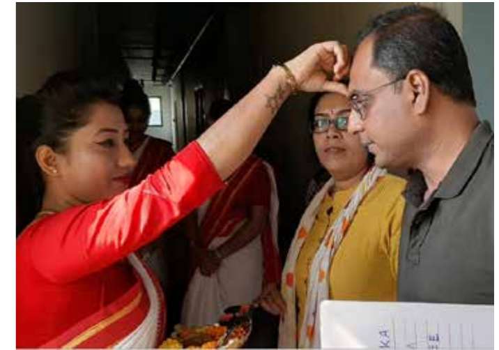
A glimpse of handing-over ceremony performed recently at Utalika - The Condoville's Efficiency & Comfort complex to welcome the residents