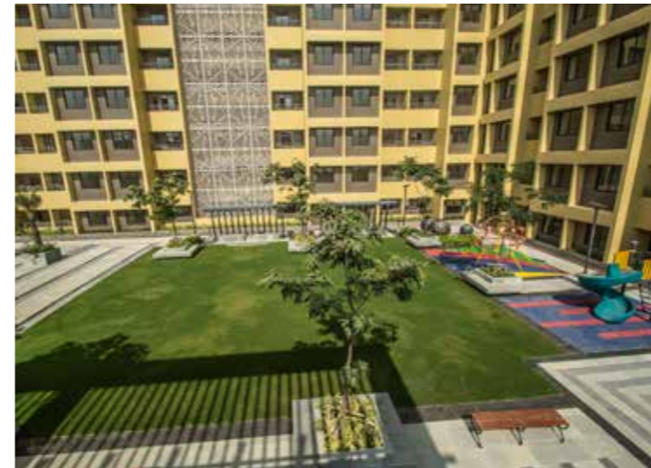
A lush green central lawn with an attached kids' play area