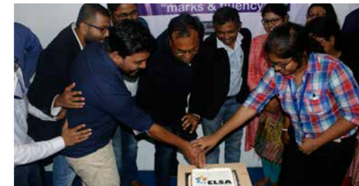
Celebrating 50,000 myELSA App downloads

Top 20 Most Promising Startups in the CIO Review.