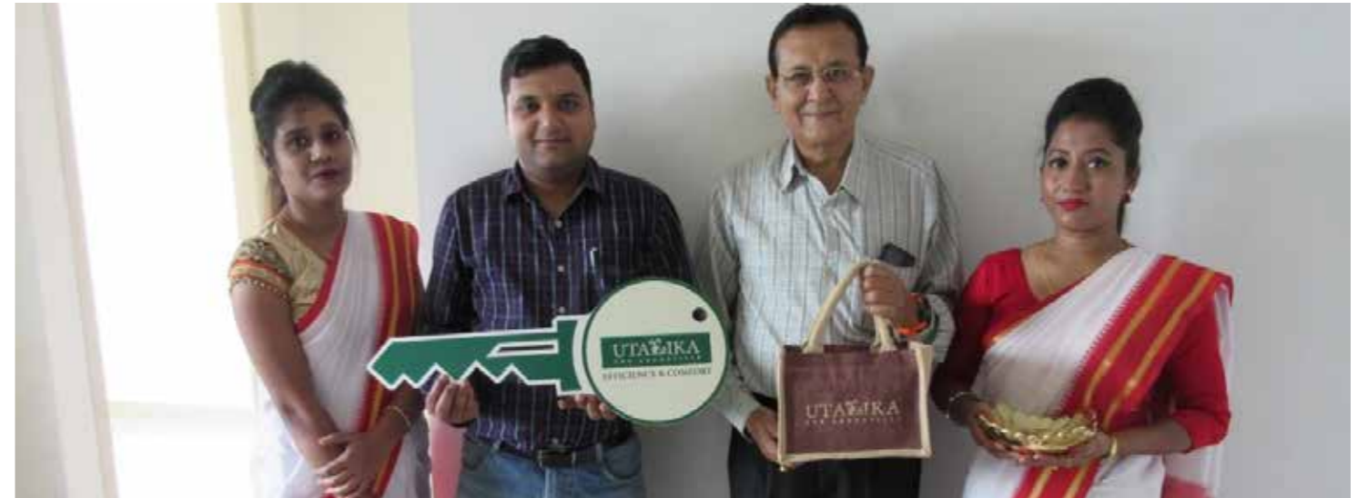
A batch of happy owners with a replica of the key to their flats and a token gift that will remind them of their first day at the premises