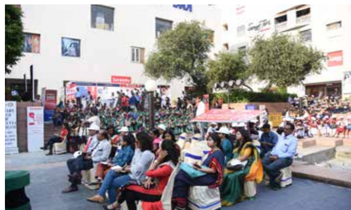
BNWCCC, New Town and Genome partnered with The Bengal Obstetric & Gynaecological Society to organise a Health Mela at City Centre Salt Lake