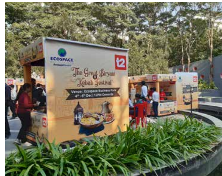
The Great Biryani & Kebab Festival (left) and Bakery Carnival (right) at Ecospace Business Park ushered in the spirit of winter feast to the working professionals