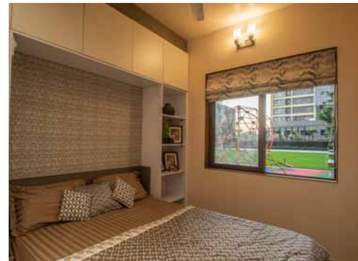
A cosy and comfortable bedroom