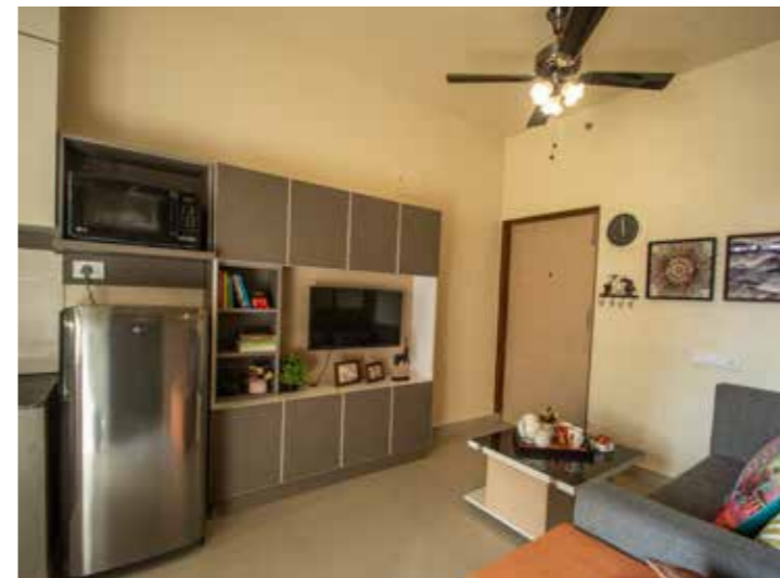
A typical living room cum kitchen area