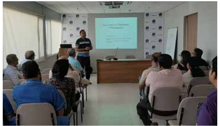
BNWCCC, New Town, in association with New Kolkata Academy of Paediatricians (NKAP) organised a CME on 'Approach to Paediatric Orthopaedics' and 'Approach to Paediatric Orthopaedic Genetic Disorders' at the hospital premises in the midst of eminent doctors