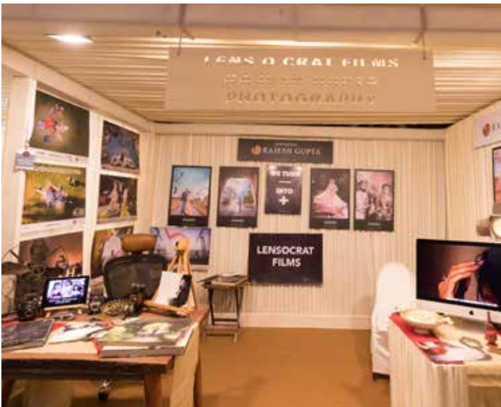
Rajesh Gupta's Lensocrat Films captured the event's memorable moments