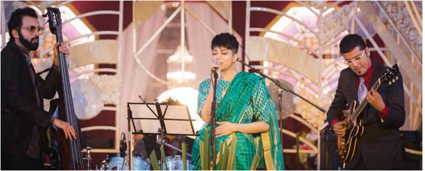
A musical performance that added to the spirit of Wedding Diaries