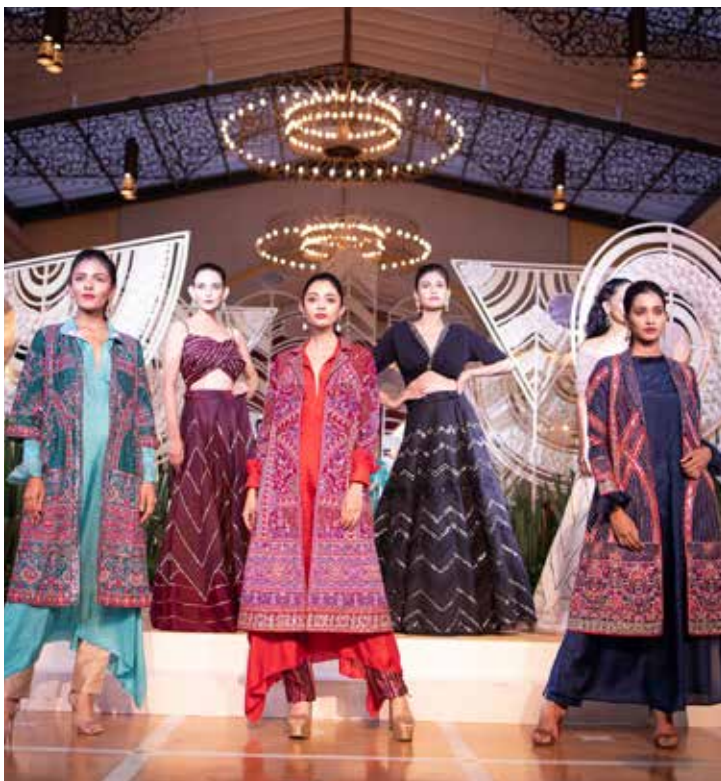
A fashion show highlighted the costumes and colours that make Indian Weddings so fun-filled and special