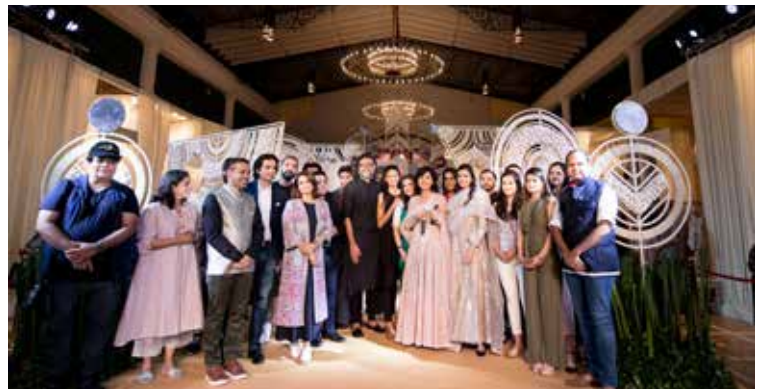
Smile please! The gang who worked tirelessly behind the scene