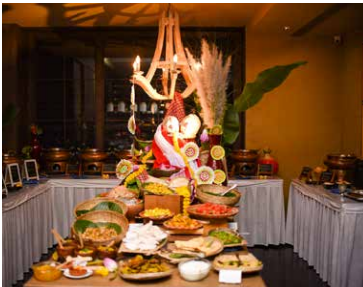
A lavish spread at Afraa Lounge & Restaurant to welcome the festive season