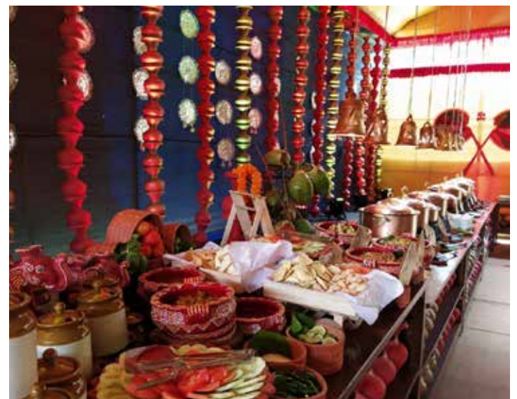
Another sumptuous spread at Raajkutir to usher in Durga Puja