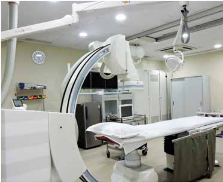
A catheterization laboratory for various examinations related to the heart