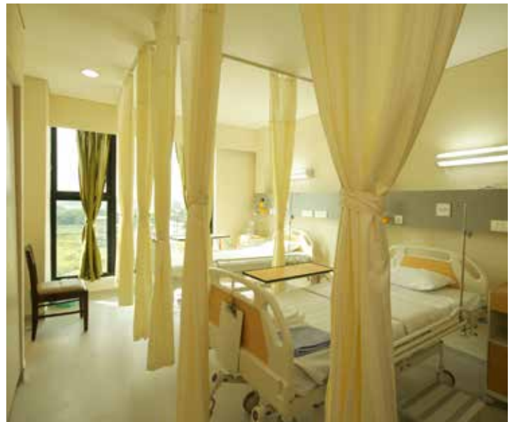
One of the comfortable Twin Bed Wards