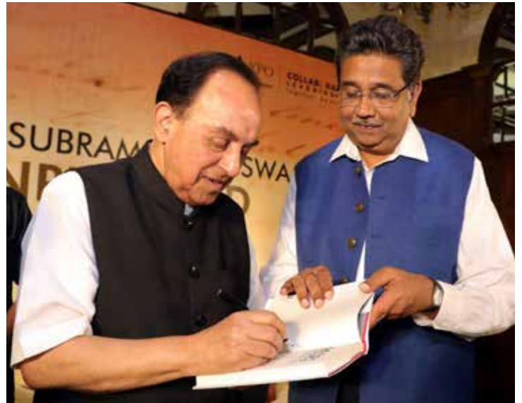
Dr Subramanian Swamy gifting his recently launched book 'Reset: Regaining India's Economic Legacy' to Harsh Neotia