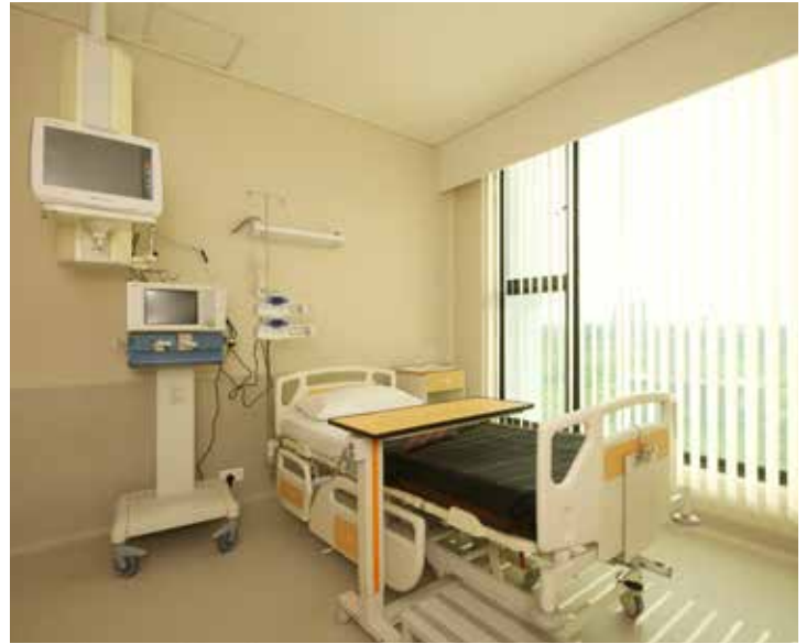
A view of the Intensive Care Unit for critical patients