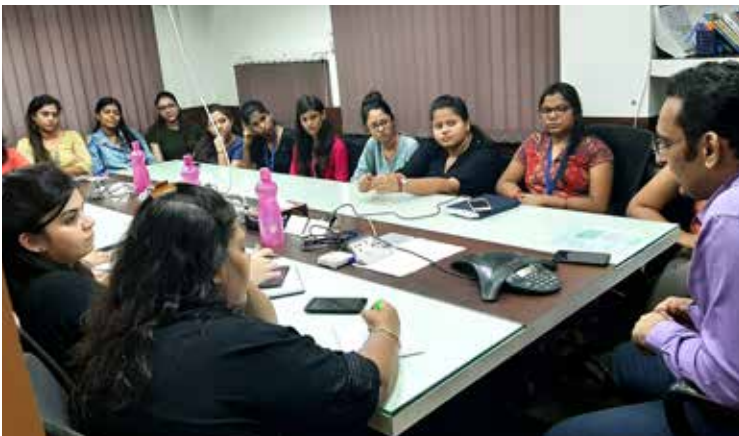
BNWCCC, Rawdon Street, organised a Health Talk on Women's daily life fatigue and weakness, at Clirnet Services Private Limited in Kolkata