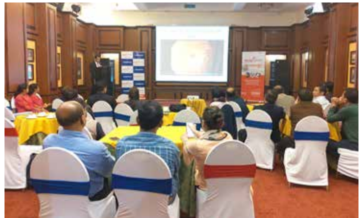
Neotia Getwel Healthcare Centre organised a CME on Management of Acute GI Emergencies & Advanced ERCP & Endoscopy at Darjeeling