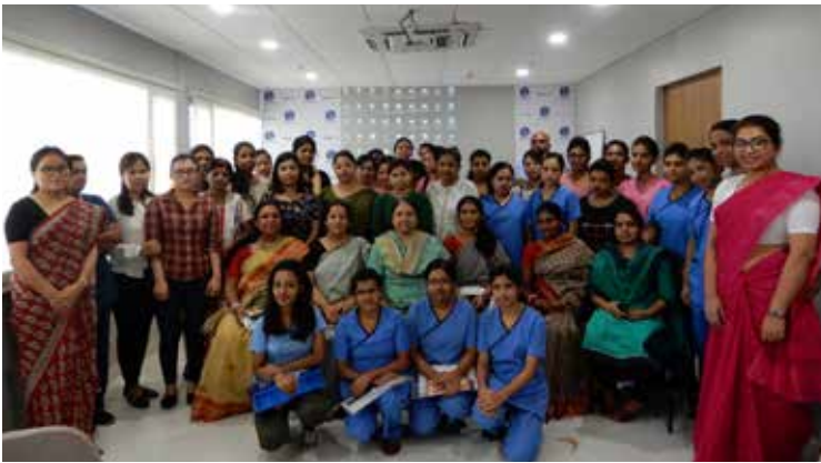
The Nursing Department of BNWCCC, New Town, organised a One-Day Workshop on 'High-risk Pregnancy' at the hospital premises. Eminent doctors were present at this important workshop. Our nurses also participated in an interesting quiz competition organised on that day