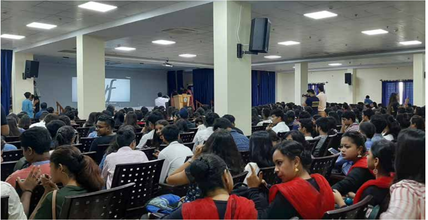
Bhagirathi Neotia Woman and Child Care Centre, New Town, was proud to be associated with St Xavier's University, New Town, as Healthcare Partner at XAVCOMM, organised recently by the educational institution