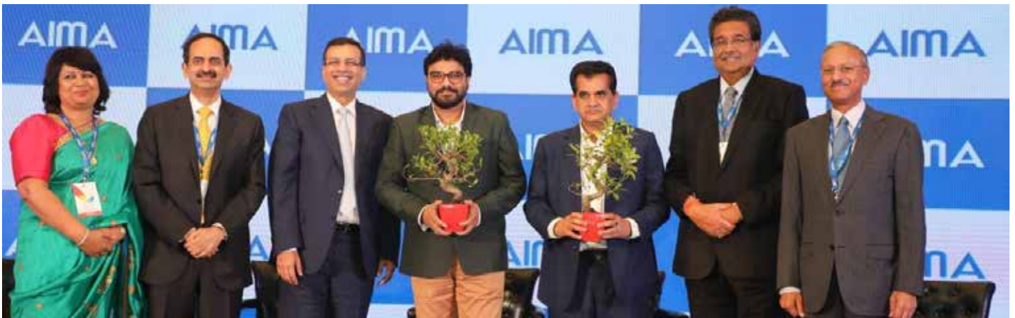
A moment from the recently held AIMA Convention on Creating An Innovative India held in New Delhi