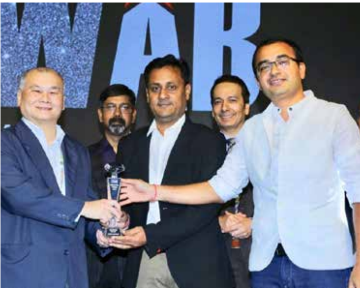
Raajkutir was recently recognised as a noteworthy project in the hospitality category by the 'Construction World Architect & Builder' awards