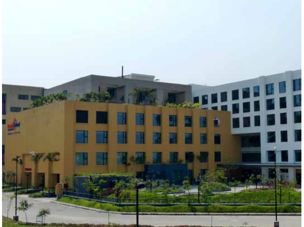
Neotia Getwel Health Care Centre in Siliguri, North Bengal

A mbuja Neotia Group's multispecialty hospital, Neotia Getwel Healthcare Centre, is an NABH accredited state-of-the-art hospital in Siliguri, North Bengal, offering one of the best of health services in multispecialty and super specialty segments since the last 7 years. Focusing to fulfill the divergent health concerns of people efficiently and ethically, the hospital premises, beautifully landscaped, sprawls across three acres. This 250-bedded medical centre also offers an excellent Neonatal Intensive Care Unit (NICU), Paediatric Intensive Care Unit (PICU), single and multi occupancy patient rooms, OT, Cath lab and Adult ICU equipped with modern technologies that holistically cater to the healthcare needs of patients with world-class medical services. The Vinod Neotia Charitable Ward, a subsidized medical care unit for under-privileged patients, provides advanced medical services to the weaker sections of our society. The hospital also adheres to international norms of energy efficiency and waste management.