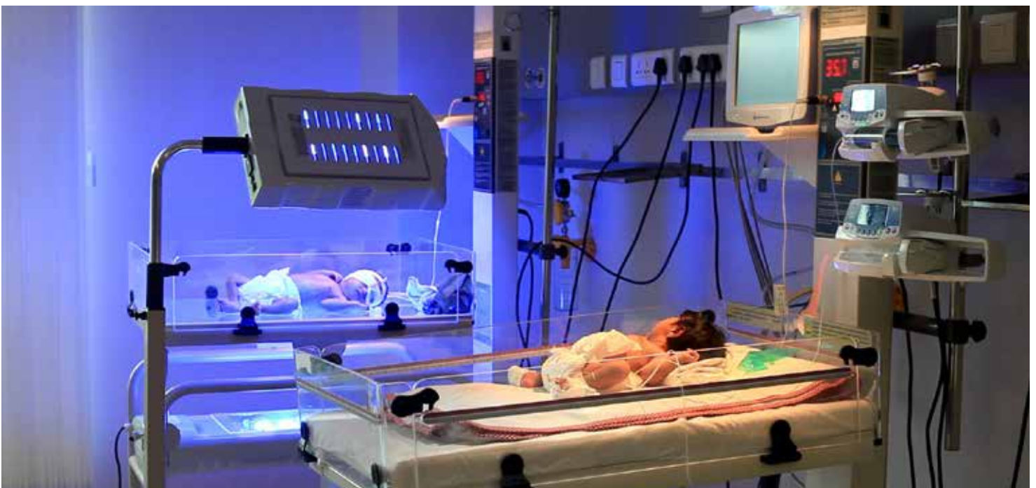
The hospital's state-of-the-art Neonatal Intensive Care Unit