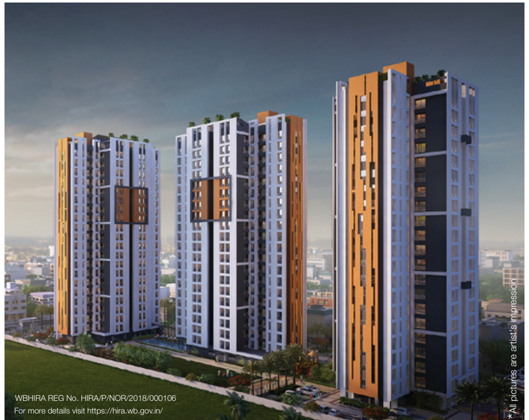
WBHIRA REG No. HIRA/P/NOR/2018/000106 For more details visit https://hira.wb.gov.in/

Located at Sinthee More, Uddipa - The Condoville is changing the skyline of North Kolkata. It comprises three G+20 towers that sport 2 and 3 BHK apartments overlooking the Sinthee Circus Maidan. Life here is a reflection of our city's rich history that blends contemporary needs with age-old classic advantages. At Uddipa - the Condoville you can soak in the spirit of tranquil surroundings, abundant greenery and open spaces complemented by a host of delightful amenities. The apartments not only have the advantage of a great location but are also well-designed, blending intelligent planning and a sensitive understanding of how spaces need to be utilized. Our commitment to 'Green Living' seamlessly enables you to discover a modern way of life at your own pace. Recently, Uddipa launched Tertiya, the final tower of the project which is now open for booking.