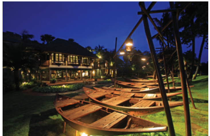
Sonar Tori at Raichak on Ganges harbours a magical environment