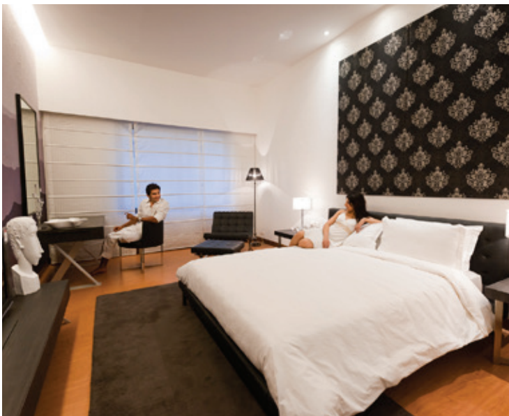
One of Club Verde's well-appointed guest rooms