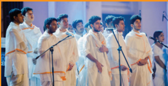
A prayer composed by Swamiji was performed by young boys and girls of Ramakrishna Mission