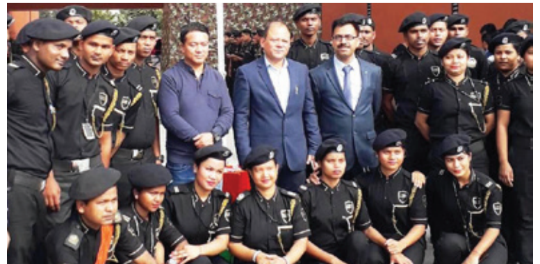
Republic Day was celebrated with solemnity across all our City Centre malls located at Kolkata, Haldia, Siliguri and Raipur