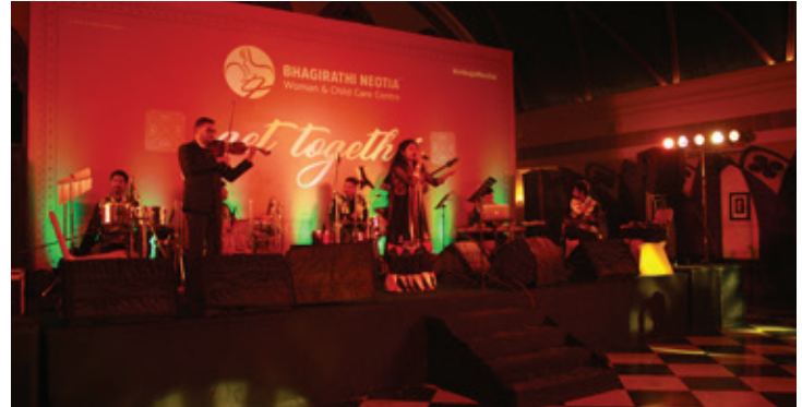
A gala get-together for doctors was recently organised jointly by BNWCCC's Rawdon Street and New Town branches at Raajkujur's Rangmanch in Swabhumi. The event featured lively musical performances, followed by cocktails and dinner