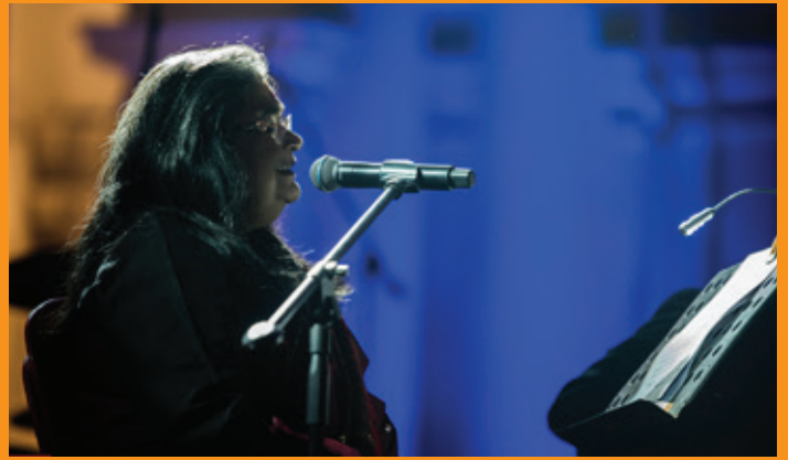
Usha Uthup sang 'Imagine,' the anti-Vietnam war anthem