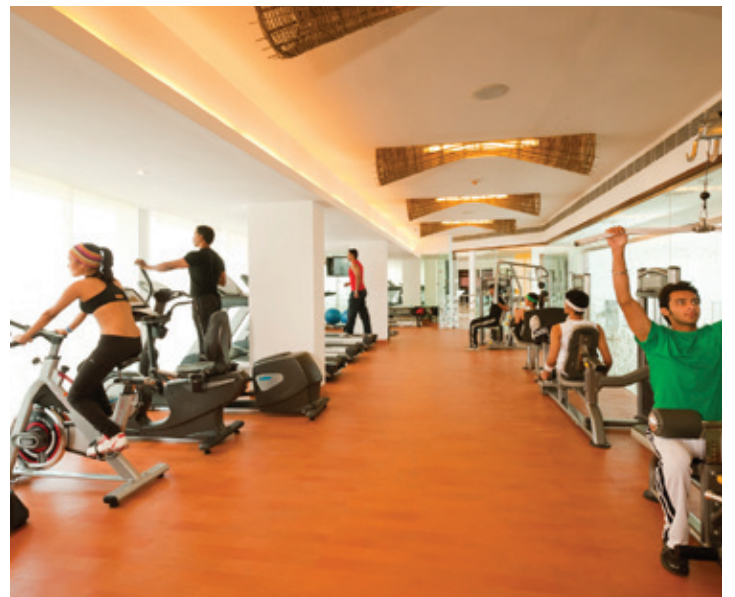
The state-of-the-art gym