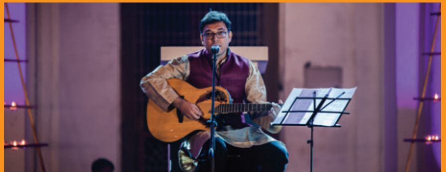
Anupam Roy rendered 'Mono Cholo,' a composition by Swami Vivekananda