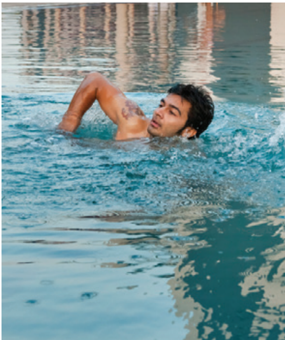
The swimming pool at Club Verde