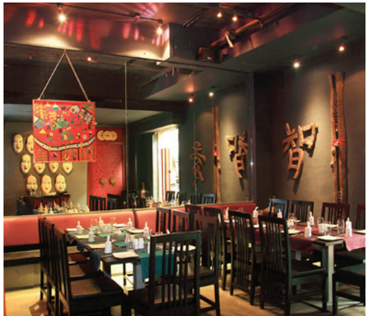
A view of the The Orient at City Centre New Town