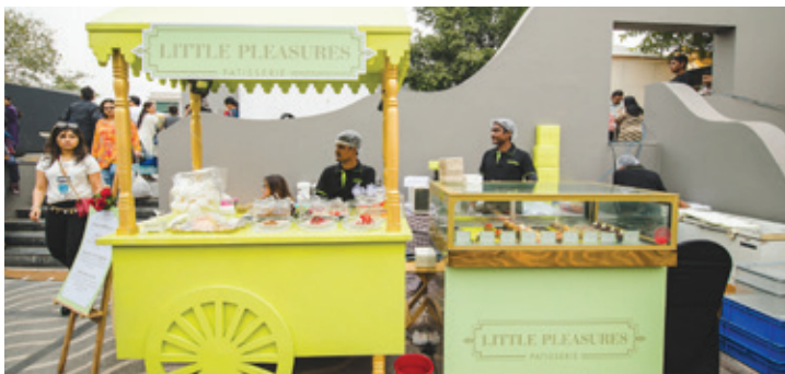
Innovative cuisine has been a major attraction at TIS. An attractive food Kiosk drew several visitors to sample what was on offer