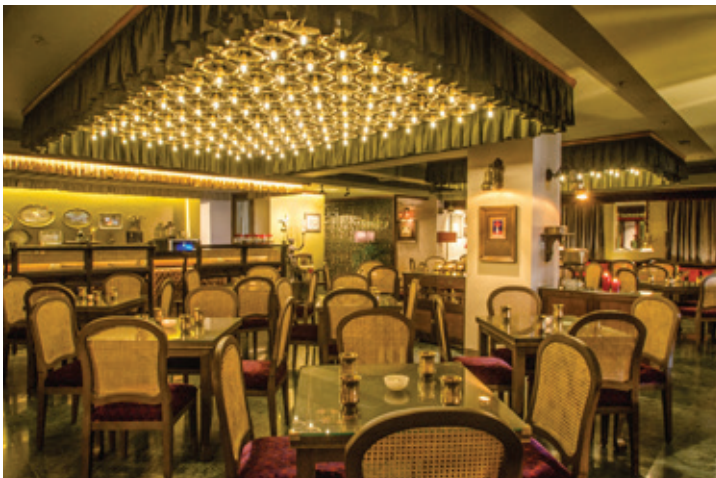
The main dining area at Sonar Tori City Centre Salt Lake