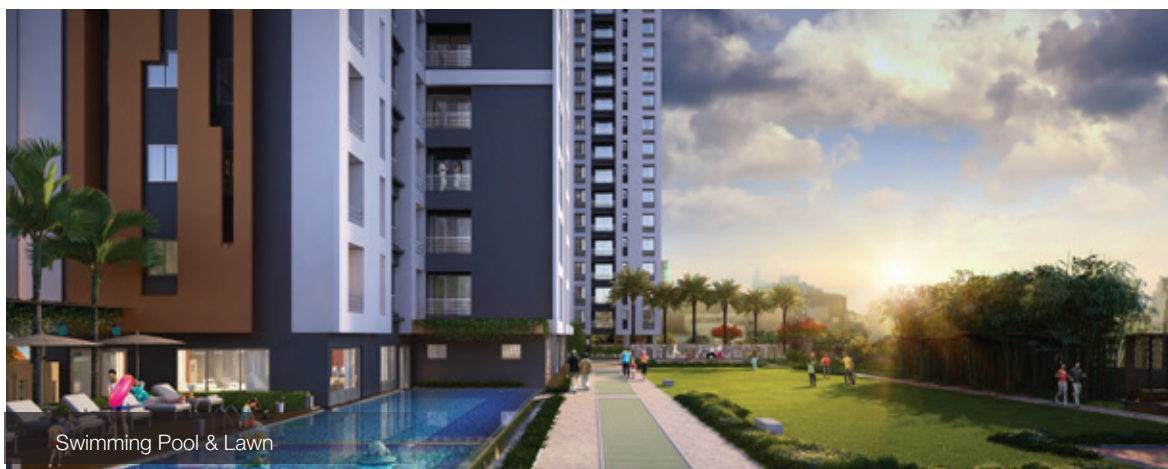
Swimming Pool & Lawn