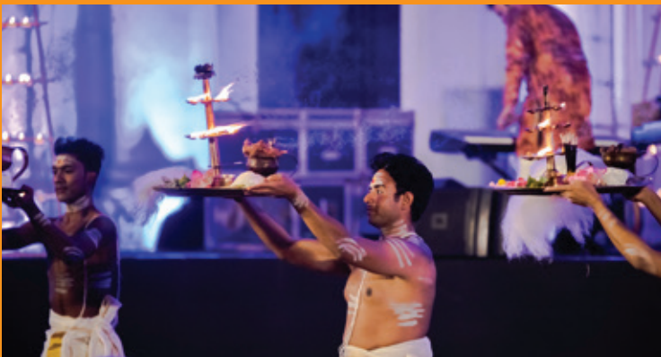
A dance performance at the concert