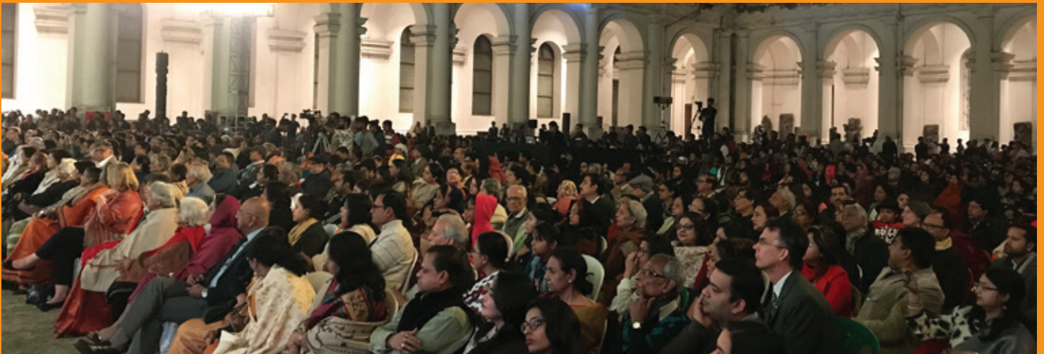
A view of the large audience that attended the concert held at the impressive courtyard of the Indian Museum