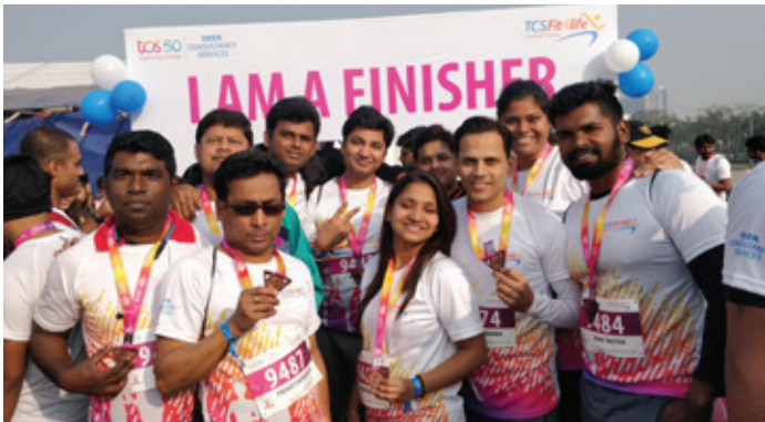
Members of the Ambuja Neotia Group also participated in the TCS Fit4Life marathon recently held at Kolkata