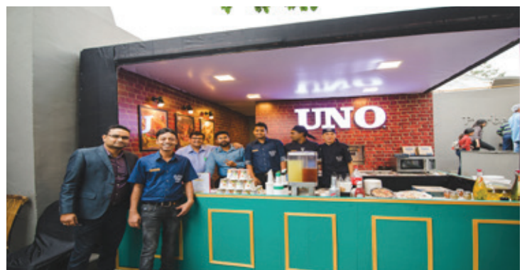
UNO Chicago Bar & Grill food kiosk at The India Story was a big hit