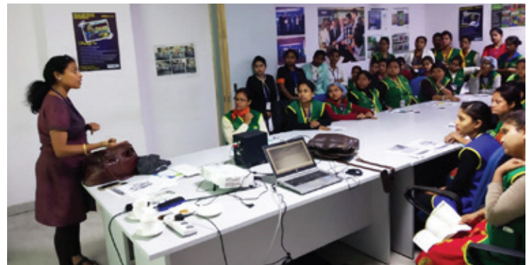
Another Health Awareness Session was arranged by BNWCCC Rawdon Street focusing on working-out at the workplace at Metro Cash & Carry for their women employees