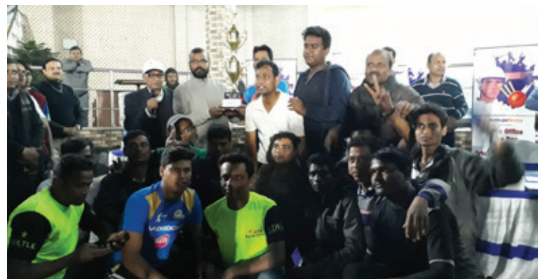
A corporate cricket tournament recently organised by the Human Resource Department of Ambuja Neotia Group saw 12 cross functional teams participate. Facility Management team emerged as winners