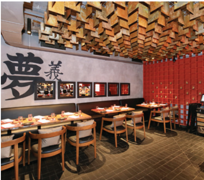
The Orient at City Centre Salt Lake has attractive interiors