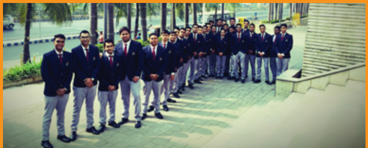
The Neotia University's School of Hospitality & Culinary Art organised a visit for its students to Swissôtel, Kolkata, one of the best-known Swiss brands in the world, as part of a relationship-building exercise between the college and the hospitality industry