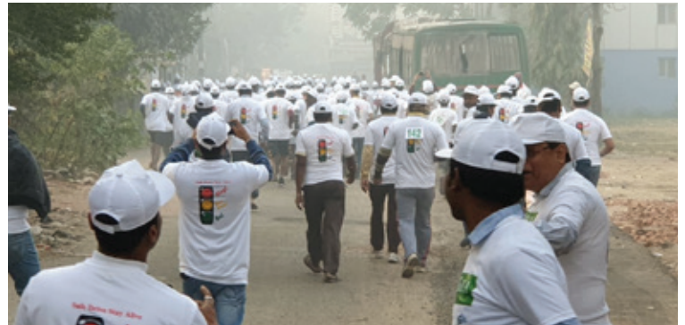
A first-of-its-kind marathon was recently organised by Utalika, kicking off from the construction site. The marathon brought together various employees and workers associated with the project, along with those of Shapoorji Pallonji