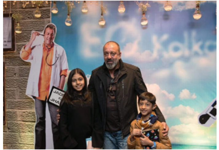
Sanjay Dutt, celebrated Bollywood star, visited Altair Hotel recently at the invitation of the Entrepreneurs' Organisation for an interactive session with their internal team members