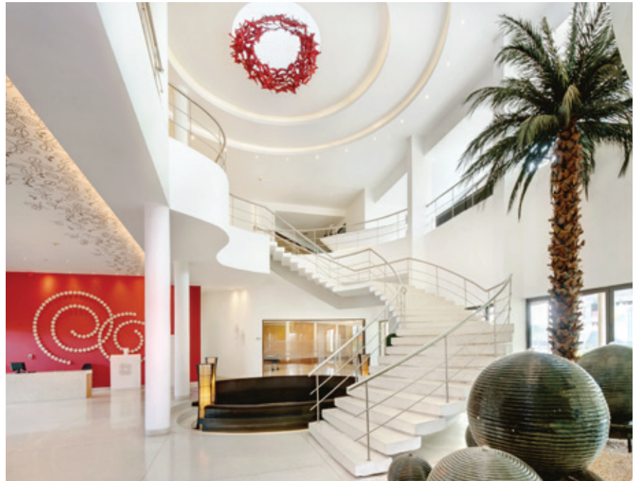
The spacious entrance to the club