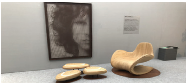
An exhibit at TIS wove magic around the theme 'Above and Beyond.' In a short period of four years this unique exposition has become a major event in Kolkata's artistic and social calendar