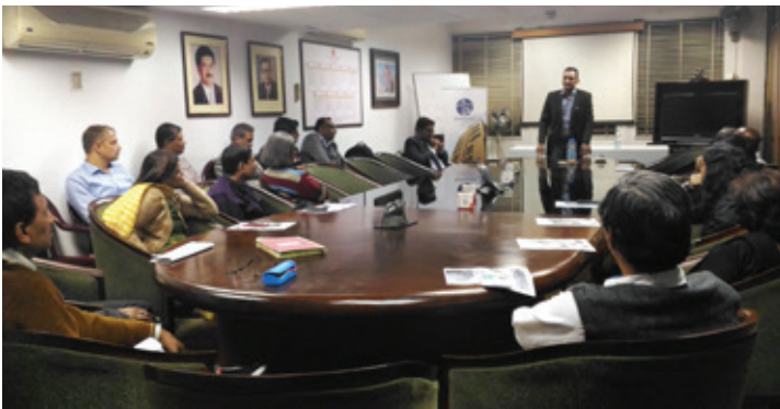
BNWCCC Rawdon Street hosted a Health Awareness Session on the uses and misuses of antibiotics in our daily life for the staff of Hindalco Industries Limited. The session was an eye-opener for the attendees