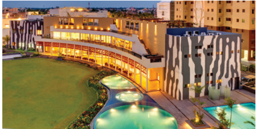
A view of Club Verde's spectacular outdoors

A club is usually founded on principles of camaraderie and communal bonding. All social clubs reflect today's more eclectic and varied society. Club Verde is one such club located at Upohar - The Condoville off EM Bypass in Kolkata, providing an exciting and world-class clubbing experience. Focusing on entertainment, sports, recreation and other leisure facilities, it satisfies individual and family needs for its members with excellent infrastructure. The club also has well-appointed restaurants, banquet halls, four comfortable guest rooms, a Spa and other facilities that include a library, a card room, a games room, badminton court, an outdoor swimming pool, a tennis court and a gymnasium. Welcome to Club Verde! Come and experience a contemporary oasis that is making a difference to the way people unwind in the heart of South Kolkata.