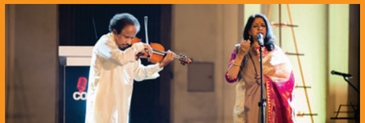
Dr L. Subramaniam & Kavita Krishnamurthy rendered 'Vaishnava Jana Toh'