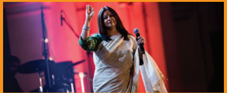
Rekha Bhardwaj ushered in the message of peace and goodwill to mankind with a bhajan composed by Kabir, the celebrated saint